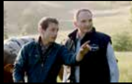
Our Partner Breeders...