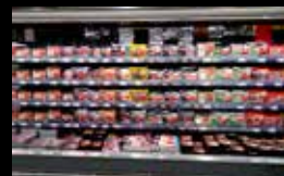
...and Grocery Stores.

BIGARD BIGARD Distribution CHARAL SOCOPA CIPA